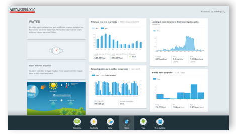
Showcase renewable systems, green building features, and sustainability programs.

1150 Roberts Boulevard, Kennesaw, Georgia 30144 770-429-3000 Fax 770-429-3001 | www.automatedlogic.com © Automated Logic 2017