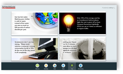
Educate facility occupants about sustainability goals and progress.

Collaborate and drive action – Engage building occupants with compelling public dashboards, and use our seamless sharing tools to deliver key findings to any stakeholder—wherever they are.